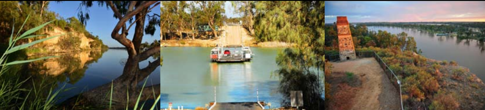
PHOTOS: Majestic Murray River landscape at Cadell. Take a free ride on the Cadell or Waikerie Ferry. Experience the views on the Waikerie Historical walk